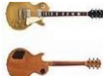
Rock & Roll Memorabilia in