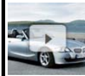
BMW Z4: Elegant and Stylish