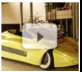
Inside Project M