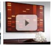
dna 11 from live comes art