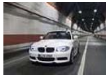
2011 BMW 135i Convertible Review