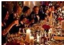
Deep Pockets Food & Wine Fundraisers