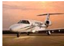
Cessna: A Look at the Citation Lineup of