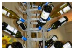
Scoring a wine century