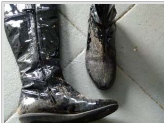
Cinderella's slippers, #ANV11 style /Michelle Locke