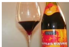
Bring on the Beaujolais