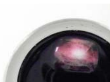
Ice, ice baby!