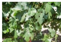
Learning to speak vinacular: Meeting the great crew'