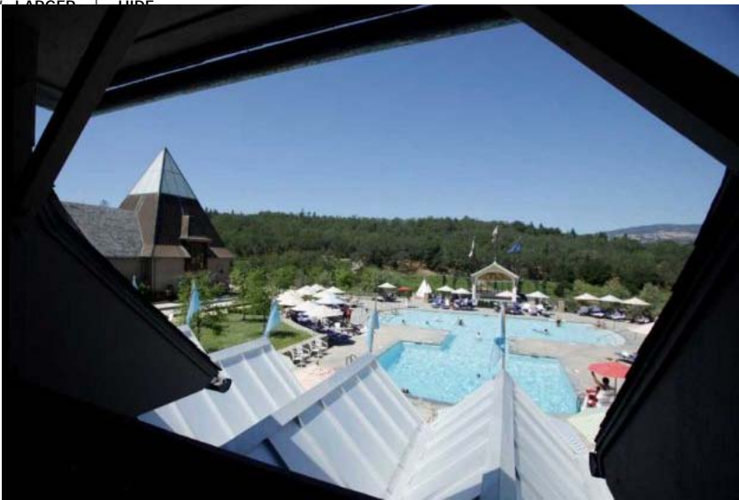
In this photo taken Friday, July 1, 2011, families are shown in the pool at the Francis Ford Coppola Winery in Geyserville, Calif. You might think kids would be about as welcome at a winery as cork taint. But happily for those who didn't lose their palates when they became parents, there are wineries that welcome all in the family. Francis Ford Coppola Winery has a lifeguard-staffed pool and a restaurant, Rustic.