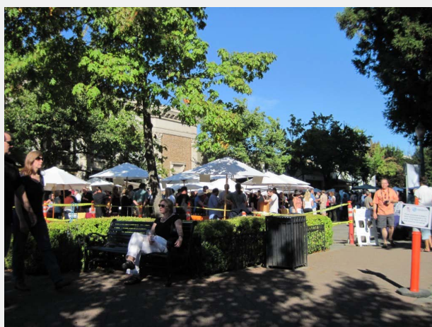
Crowds on Plaza Street – Pinot Festival

October is Major League Baseball’s main event. If the A’s and Giants had fared better it might be true for the denizen’s of northern California. However, with the local teams “waiting until next year”, those who see Harvest as the real or alternative main event for October weren’t disappointed at the 8 th Annual Pinot Festival “Pinot On The River” in Healdsburg. This event is held for the benefit of the Boys and Girls Clubs of Central Sonoma County and was a Home Run by any measure!