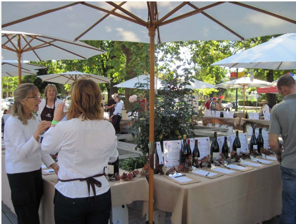
Silent Auction at Pinot Festival

A terrific event, with early admission available for an additional fee, the Pinots were wide-ranging in flavor profiles and prices. A special focus, and seminar, was held highlighting the Pinots of the Santa Cruz Mountains. The best part of this event is that you can taste and learn about very limited production vintners whose case production is as small as 400 cases per year in the beautiful Russian River Valley town of Healdsburg, California.