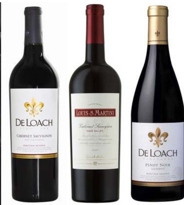
A trip to California as an 11-year-old inspired French winemaker Jean-Charles Boisset to return to the U.S. in his quest for great Pinot. From left to right: DeLoach Cabernet Sauvignon, Louis M. Martini Cabernet Sauvignon and DeLoach Pinot Noir.