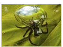
Underwater spider uses air bubble like an oxygen tank