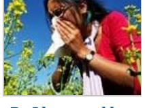
Do I have a cold or allergies?