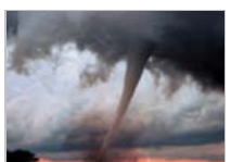
Translating Uncle Sam: Tornadoes explained