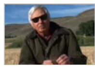
Idaho Barley Farming: Good for Beer, Business, and the Environment