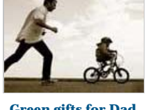
Green gifts for Dad