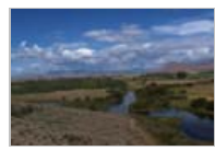
Preserving Silver Creek