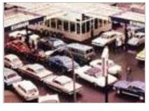
Why state caps on oil prices don't work