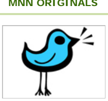
Mixed Greens: Leading voices in sustainability