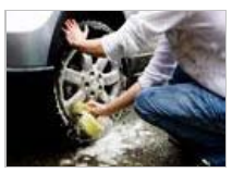
Father's Day gift ideas for the self-reliant dad