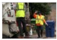
MillerCoors and Recyclebank: Recycling for Good Environment