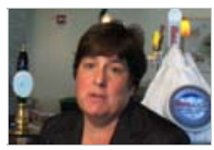
MillerCoors commits to reducing waste to landfill