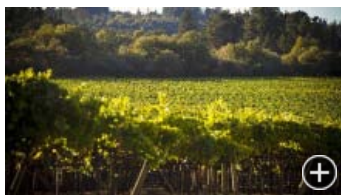
Enlarge this image