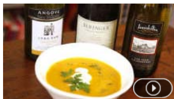
VIDEO Which wine to match with squash

I suspect wine style , rather than quality, has much to do with it. North American consumers have long been smitten with the mouth-filling opulence and steak-friendly flavours of cabernet sauvignon, Napa's signature red. Sonoma is better known for pinot noir and zinfandel, grapes with much smaller, if no less ardent, followings.